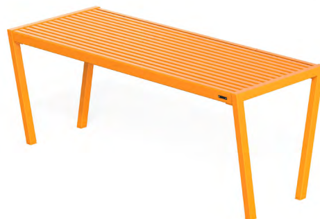
Table consisting of two 50x40x2 mm tubular steel supports and top with 4 mm thick folded steel sheet frame and 30x15x1.5 mm steel tube. All metal parts are galvanised and coated with thermosetting polyester powder. All fixings are in AISI304 stainless steel. Prepared for ground fixing through M10 threaded bars to cement (included).